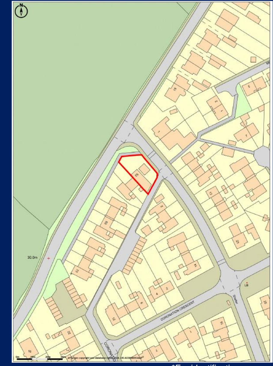
*For identification purposes only

18 St Cuthberts Way Darlington, County Durham DL1 1GB Telephone: 01325 466945