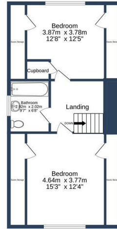
1ST FLOOR 58.5 sq.m. (630 sq.ft.) approx.

ST JOHN'S PARK, ALDBROUGH ST JOHN. DL11 7TW.