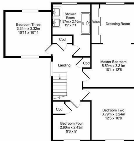
1ST FLOOR APPROX. FLOOR AREA 71.1 SQ.M. (765 SQ.FT.)