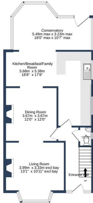
GROUND FLOOR 79.7 sq.m. (858 sq.ft.) approx.